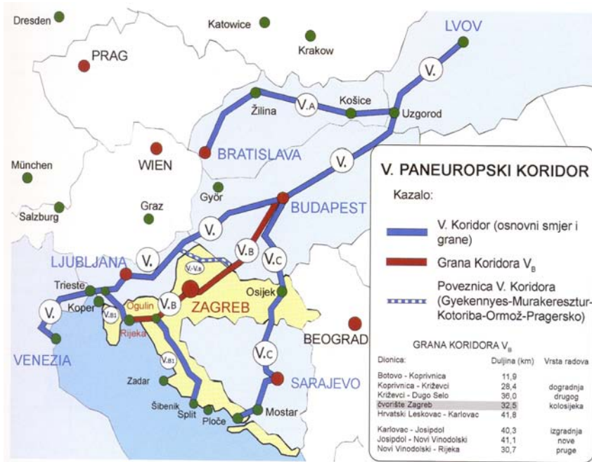
Figure 1 V Pan-European Traffic Corridor

The existing single-track railway lines from Botovo to Dugo Selo and from Hrvatski Leskovac to Karlovac, which were constructed in 1865, i.e. 1870, are of valley type, and since they were designed for lower speeds they require renewal. From Karlovac to Rijeka there is a single-track railway line in the mountainous part of the route that has been in use since 1873, whose elements and throughput potential have not been able to meet the requirements of passenger and cargo transport for years. Due to major traffic and economic importance, the planned corridor of the railway line was given priority in development plans of Croatian Railways (HŽ). In the entire segment from State Border with Hungary to Rijeka, a double track line shall be introduced, capable of carrying from 28 to 32 millions of tons of freight per year, and allowing speeds of 160 (200)km/h, which will shorten the duration of journey from Botovo to Rijeka to slightly over 2 hours.