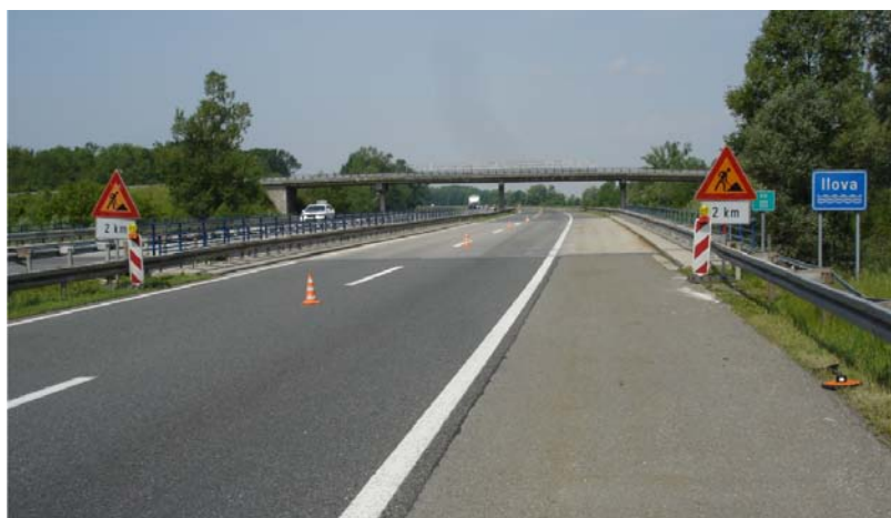
Figure 3 Test section on A3 motorway

Noise level measuring with the goal of determining riding comfort was performed in the passenger car OPEL Vectra 1.8 16V comfort, with the mileage of 130,000km (regularly maintained on every 15,000km) and equipped with Michelin Energy summer tyres size 195/65/15. The measurements of noise levels were performed in the driver's cab at the co-driver's place by means of the device Bruel & Kjaer Hand-held Analyzer Type 2270, at different movement speeds of the vehicle, from 80 to 130km/h. The test section was only on the northern pavement of the motorway, on the right-hand traffic lane, which was secured by traffic warning systems for the needs of measuring in the length of 600m before and 300m after the bridge, so that the vehicle could move along it without being disturbed (Figure 3).