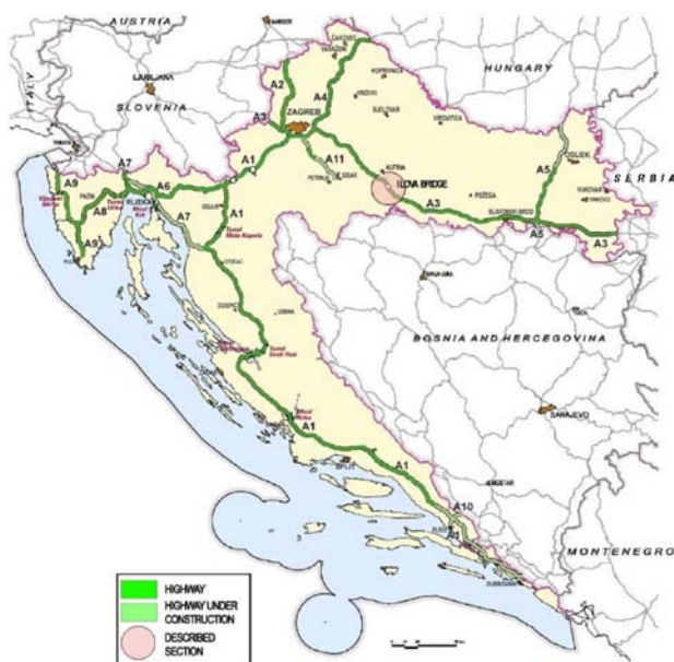
Figure 1 Location Ilova bridge

The mentioned bridge was reconstructed in 2004 (northern pavement) and in 2007 (southern pavement), whereby the existing asphalt pavement was replaced by the new, concrete one (Figure 2). Reconstruction was done in such a way that the asphalt layer of the pavement was first milled, and then the deteriorated concrete layer of the base structure was removed hydrodynamically under 2500 bar pressure.