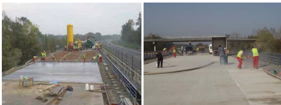
Figure 2 Presentation of works on concrete pavement on Ilova Bridge [3]

On the clean surface of hydrodemolished pavement, the fabric reinforcement Q 283 was laid, and special polymer-modified micro-reinforced concrete c 35/45 was installed, with the thickness of 10–16 cm [4]. Installation of the concrete layer was carried out by the vibratory board which does not have the performances of the device for installation of concrete pavement, so that the evenness of the driving surface was of unacceptable IRI index values. Therefore, leveling of the driving surface of pavement was approached, by grinding and granulating to the acceptable evenness from the aspect of safety [4]. The asphalt-concrete wearing course before and after the bridge was also replaced (after milling) with a new layer of Split Mastic Asphalt (SMA, 16mm). Unlike the concrete pavement, asphalt layers before and after the bridge were installed by a paver.