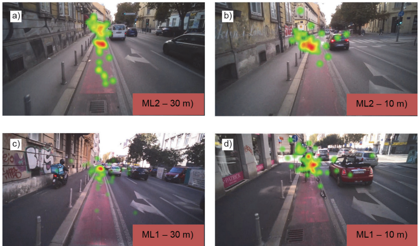
Figure 2 Gaze heatmaps showing riders' visual attention when approaching the intersection

The visualizations are consistent with the previous metric analysis. Mean fixation rates were similar at both ML2 examination points (where riders turned left), indicating that they became cautious earlier, or they were preparing for the upcoming turning. On the other hand, fixation rates were significantly lower at the more distant examination point where riders continued straight (ML1) than at the point closer to the intersection, where fixation rates increased (with more fixations around the environment).