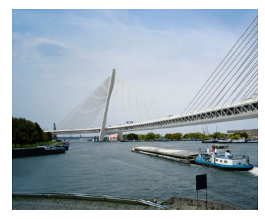
Figure 1 Project images: spatial location of project elements (left) and computer image of the double deck viaduct (2.3 km length) over Straatsburg dock, called 'Lange Wapper' (after an urban mythological figure)