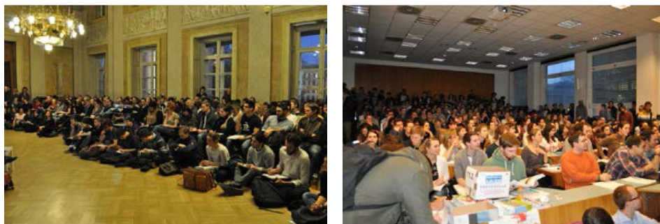
Figure 5 Overcrowded lecture room at the “Cycling in the city“ lecture“.

The first season proved to be more popular among students and general audience than ever expected. On average 255 students (min: 185, max: 287) attended the lectures (see Figure 5), so that the talks had to be live streamed to a second lecture room to meet the demand.