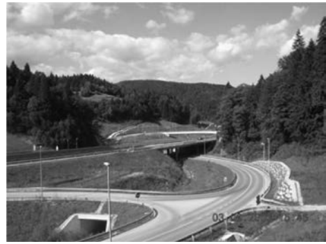
Figure 2 Transport engineers' products are massively shaping the urban and natural landscapes. Left: Parking lot dominating the central square of the UNESCO world heritage village Hallstatt (AUT). Right: national road, motorway and motorway junction ramps spare little of the quaint valley near Trojane (SLO).

So, figuratively speaking for engineers, finding the key (sustainable solutions to problems) is easier when the light beam (of knowledge and perspective) shines wider for them (see Figure 3). In this allegory ethical education provides a tool for increasing the illuminated area. With this perspective in mind it is therefore necessary to educate transport engineering students in ethical matters.