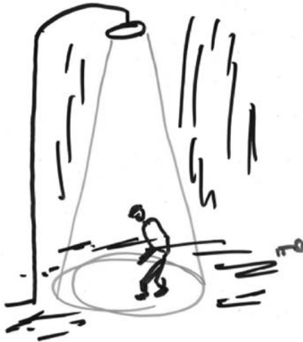
Figure 3 Streetlight effect: How to find the key (right edge) outside of the light beam? Ethical education will increase the illuminated area. Drawing: Knoflacher

So, figuratively speaking for engineers, finding the key (sustainable solutions to problems) is easier when the light beam (of knowledge and perspective) shines wider for them (see Figure 3). In this allegory ethical education provides a tool for increasing the illuminated area. With this perspective in mind it is therefore necessary to educate transport engineering students in ethical matters.