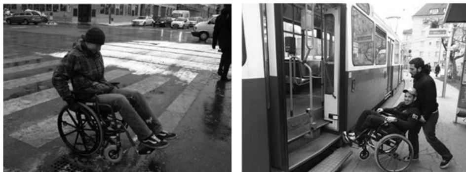
Figure 4 Students of the base course on transport planning at VUT experiencing first hand the shortcomings and barriers in the transportation system from the point of view of the weakest participants.

In an early stage all civil engineering students at VUT need to attend the basic course (lecture and field work) in transport planning. Obligatory part of the field work is the one hour movement through the city with a baby stroller or a wheelchair. There students are at the mercy of good or bad design provided by active engineers (see Figure 4). This is the first hand opportunity for future engineers to experience, how small decisions about the design of the public space and public transport effect everyday lives of people with special needs.