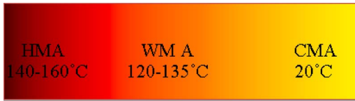
Figure 1 Typical mixing temperature for asphalt mixtures