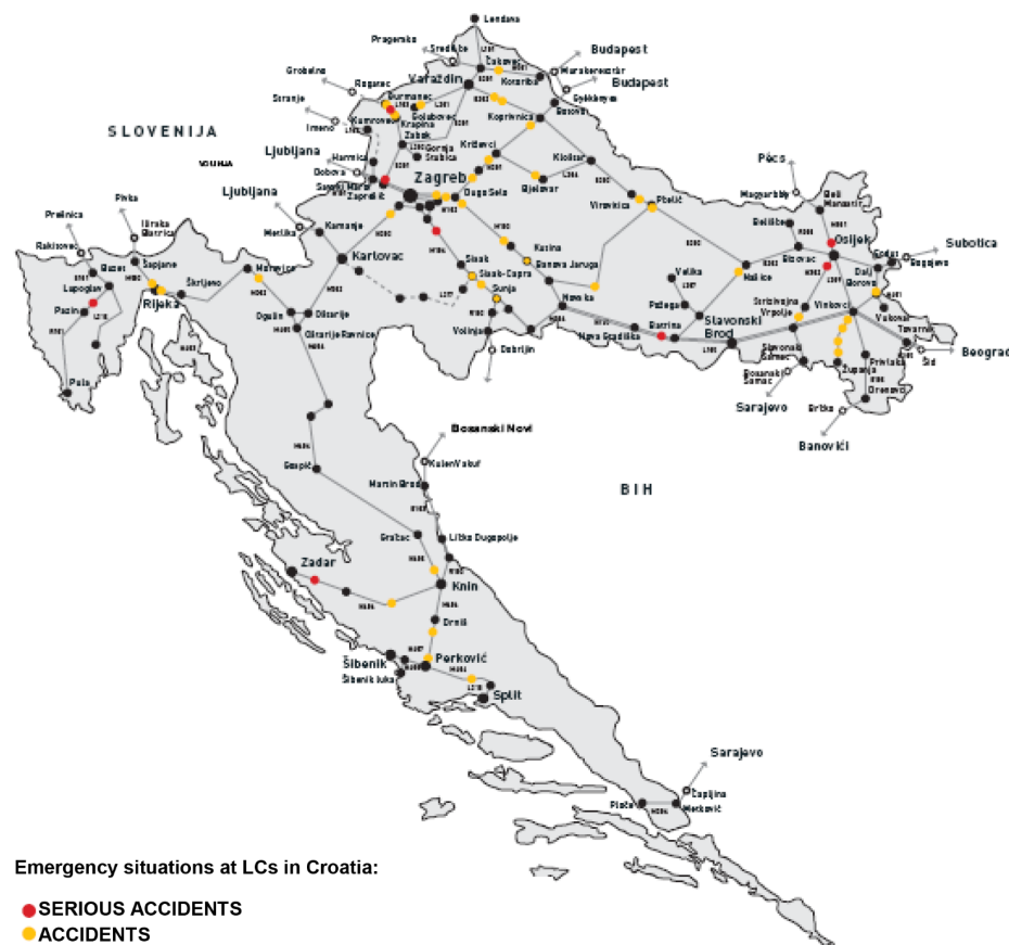
Figure 2 Emergency situations at LCs in Croatia [1]