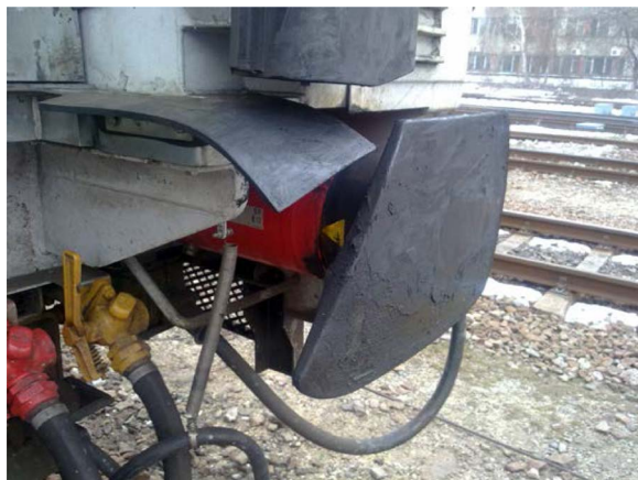
Figure 3 Fig.3. Crash buffer of a sleeping carriage operated in Bulgaria since April 2013

The design of passenger wagons is an iterative process between the process of design, selection and evaluation of a crashworthiness structure and the assessment methods. Fig. 2 shows the elements of the design process of the crash-resistant structure. The existing evaluation methods, criteria or standards are two: numerical simulation and full tests [5]. The parameters of evaluation are: deformation, energy absorption, material properties, non-linear limitations and contact. Based on the optimized parameters, an algorithm and solution as well as possibilities for structural simplification have been proposed. The crashworthiness structure of a passenger wagon frame is a subject of study carried out at the Todor Kableshkov University of Transport, in Sofia, Republic of Bulgaria. Fig. 3 shows the crash buffer of a sleeping carriage operated in Bulgaria since April 2013.