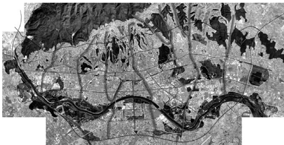
Figure 2 Green Areas of the city and transverse transport corridors [11]

During the historical periods of Zagreb development extraordinary patterns and greening typology of the series of streets, squares, etc. were created. The need to continue designing public spaces by greenery in contemporary urban development concepts of Zagreb has already been featured in directive regulatory basis in 1949/1953 and in the basic documents of the urban development of the city that followed thereafter, [12]. The present time requires significant reshaping of street outlines and other public spaces by greenery which should be weighed following the application of propositions from the categorization proposals of the transport network for the city and the concept of greening and developing the pedestrian zones of the city.