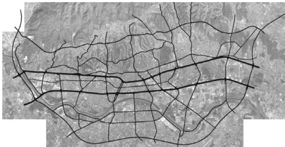
Figure 1 Schematic overview of the transport network (proposal) [4]

Basic transport network is supplemented by a series of streets whose primary function is to provide movement of traffic, but also the formalization of the built environment in which the street network is an equal part of a complex assembly of public space in which daily life of citizens is carried out.