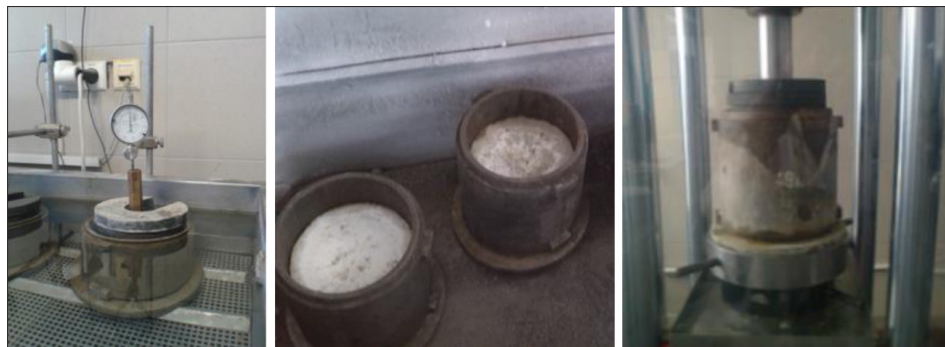
Figure 1 CBR samples at different stages of conditioning (left, middle) and testing (right)

Laboratory CBR test was conducted in accordance with HRN EN 13286-47 [17], on samples compacted by modified Proctor method at optimum moisture content. For each mixture three samples that were exposed to different curing times and conditions before testing were prepared (Fig. 1).