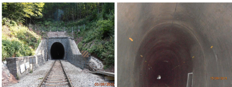
Figure 6 Cutting exit of tunnel Resnjak and interior of the tunnel after reconstruction

Reconstruction of the cutting approaches and exit cuttings of the tunnel was carried out by construction of the anchors, hexagonal double-twisted net of the cords and before their installations the drains were drilled and the dressed stones were bound by injection including the leveling of the grooves. Above the entrance and exit portal the barrier of posts, net and steel cords was constructed. The posts are constructed of the steel profiles NPI-20 and NPI-16, anchored into the concrete foundations at the distance of 3 m. The net of the barrier is hexagonal, double-twisted and galvanized. On the left and right side of the cutting exit and above the entrance portal, the concrete channels with descent were installed.