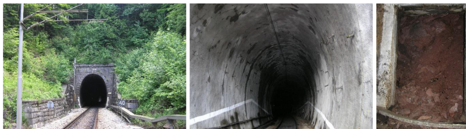
Figure 3 Entrance portal of the tunnel Resnjak, interior of the tunnel and the niche from which the material is falling

Tunnel Resnjak, 197,72 m long, is situated between the stations Zalesina and Delnice. The tunnel was constructed in 1873 for one track of the GB structure gauge (basic). It consists of seven niches which are situated at every 25 m. It is clad with the dressed stones in 34 tunnel liners, and here and there, there is shotcrete. The entrance portals, frontal walls and the wing walls in the approach cutting and exit cutting are also made of dressed stones, above which there is very unstable soil with tendency of sliding and rockslides. From the last niche before the exit portal, the material has been falling onto the track; therefore for safety reasons the slow running of trains of 20 km/h is introduced in the tunnel.