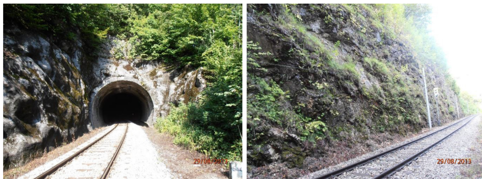
Figure 1 Entrance portal of tunnel Tičevo and the exit cutting

In selection of the solution of reconstruction it was necessary to take into consideration the height of the overhead line equipment and its minimum distance from the tunnel vault, meeting of conditions of the GB structure gauge, and in the approach and exit cuttings, for the sake of integration into the natural surroundings and preservation of the original configuration, the technical solution should be such to let it blend into the natural surrounding and retain its authentic configuration and appearance, and at the same time to be in line with the technology of works on the railway lines (carrying out of works at a fast pace within a short period). All railway tunnels are constructed without hydro-insulation which protects from penetration of water, and the rings of dressed stones are at the same time their primary and secondary lining. Tunnel Tičevo, 173 m long, was constructed in 1872 for two tracks. It is situated between the stations Ogulinski Hreljin and Gomirje and consists of 19 tunnel liners, rings of dressed stones with the interspace of the live rock, and the overburden of ca. 10 m, on which here and there is shotcrete. The entrance portal has already been reconstructed with shotcrete and exit portals are situated in the live rock. The approach cutting and exit cutting are also in the live rock.