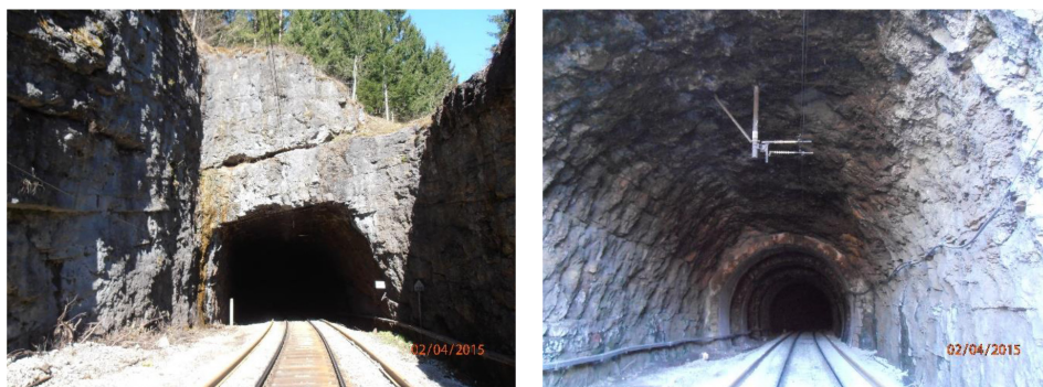
Figure 2 Entrance portal of tunnel Kloštar and tunnel's interior

Tunnel Kloštar, 248,40 m long is situated between stations Gomirje – Vrbovsko. It was constructed in 1872 in the limestone rock with the overburden of ca. 7 m. It has five tunnel liners, i.e. rings of dressed stones with the interspace of the non-lined rock. Its width accommodates two tracks. On all five rings there is shotcrete of questionable stability. The entry and exit portals are of the live rock above which there is the earth mass underpinned by the mass of the trees. The approach and exit cutting are in the live rock.