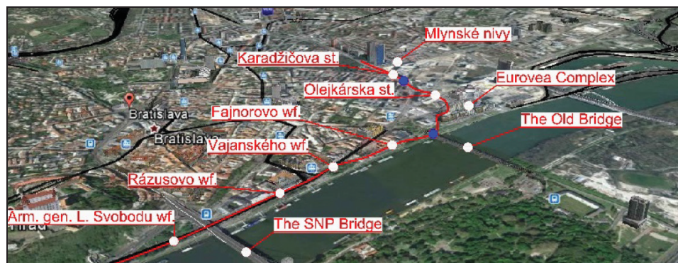
Figure 4 Designed tram track (red line) in the riverbank area

The tramway route layout according to [4] (Figure 4) starts at Ľ.Štúr square at the current rail intersection from Rázusovo waterfront to Vajanského waterfront and continues towards Slovak National Museum, where it turns to Fajnorovo waterfront, using two contra directional curves. The problem of the longitudinal alignment is at the interchange with the Old Bridge, mainly because of the need to keep the clearing cross-section of the double track tram route under the Old Bridge.