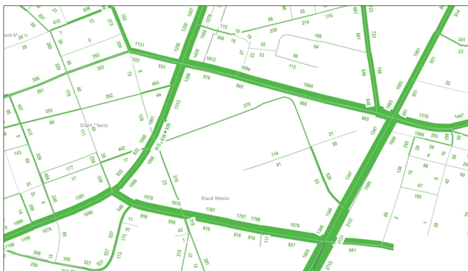
Figure 5 Scenario of present situation for the morning peak from MTP

Creating a model for a new territorial development with new tram lines is a complex work of traffic engineers and planners according the definitions of the City of Bratislava it were a requirement to use the model from TMP. The original