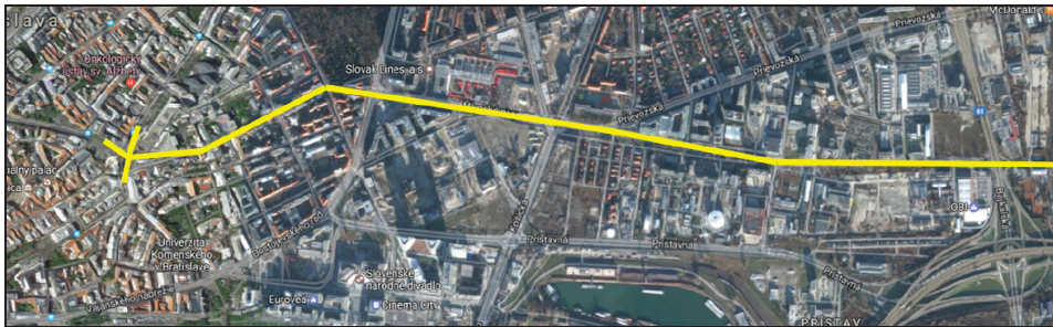
Figure 3 Scheme of the new tramway line Dunajská – Mlynské nivy