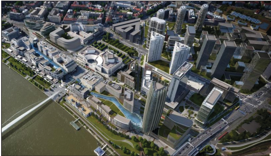
Figure 1 Visualization of the southern part of New City centre in Bratislava

multiply the value of his real estate with minimal expenses, regardless new people – city residents – once living, working or spending their time in his investment. Furthermore each new investment affects the existing urban area, where other people live for even decades and they think of their environment very conservatively. The city should stand on the inhabitants side and direct the development so that it would be pleasant for the people to remain, eventually to constantly return for work, services and amusement, because the city is worth living in. The answer should be the measurability of the sustainable development/transport together with clear rule what the smart deal in the city is really.