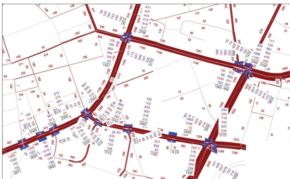
Figure 6 Scenario of present situation for the morning peak from MTP