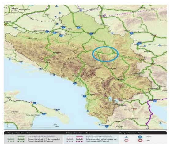
Figure 1 Expansion of the TEN-T railways into the western Balkan with the placement of the Stalać-Kraljevo-Rudnica railway.

The improvements to the railway infrastructure in the already mentioned sections will contribute to the establishment of high quality regional passenger traffic, by which a good connection will be made between south Serbia and Belgrade, while when it comes to cargo transport, the needs of local economy will be meet, primarily the automobile industry and energetics. The task of the Previous feasibility study and the General reconstruction and modernisation project of the railway section Stalać-Kraljevo-Rudnica (WBIF WB14-SRB-TRA-01) was to define alternative solutions and ways in which the reconstruction and modernisation of railroad sections could be carried out in line with the requirements of modern transport systems, then comparing them on a functional, technical, economical, financial, spatial, ecological and social level, and making the decision on the optimal variant solution.