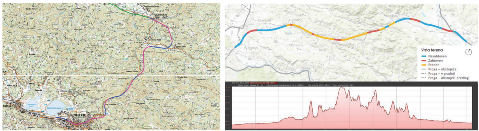
Figure 3 Example of a sections of the new Velenje-Dravograd and Ljubljana-Celje line, showing the different terrain complexities by colour