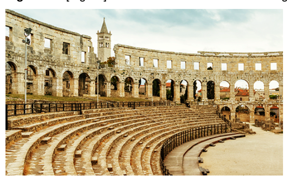
Figure 5. [Figure caption] This is an example for a caption longer than one line of text. The figure represents roman amphitheatre in Pula, venue for CETRA 2020