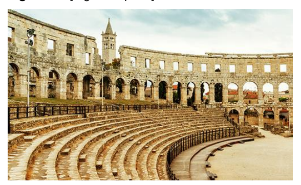
Figure 5. [Figure caption] This is an example for a caption longer than one line of text. The figure represents roman amphitheatre in Pula, venue for CETRA 2022