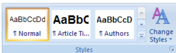
Figure 2. Styles group in Microsoft Word 2007 - 2016

[Normal] The process of applying styles to text is simple: just position the cursor in the block of text you wish to style and pick an appropriate style name from the list mentioned in the preceding paragraph. In many cases this will not be necessary as this template is programmed in a way that it tries to 'guess' the correct style based on the flow of text.