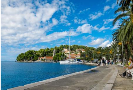
Figure 5. [Figure caption] This is an example for a caption longer than one line of text. The figure represents Cavtat, Croatia